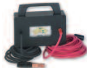
Part No. 20006