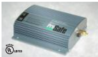
ProSafe 30 Amp Galvanic Isolator For single 30 Amp shore cord