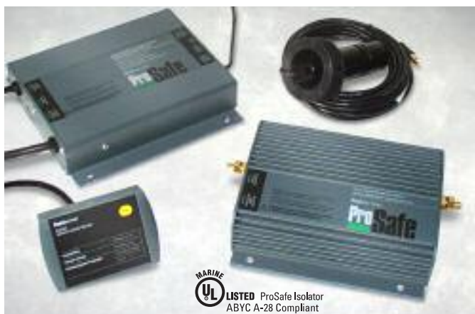
ProSafe Deluxe 30 Amp Single AC Line System Shown

Available in 50 Amp Single / 30 Amp Dual AC Line System Package