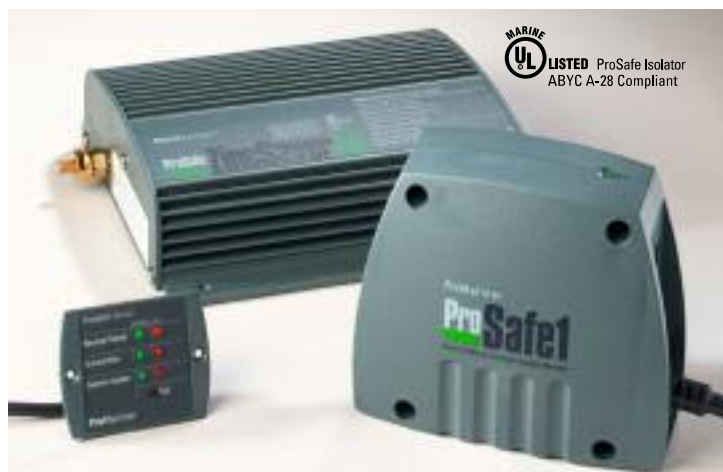
ProSafe 1 30 Amp Single AC Line System Shown

Available in 50 Amp Single / 30 Amp Dual AC Line System Package