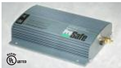
ProSafe 60/30 Amp Dual Galvanic Isolator For dual 30 amp or single 50 Amp shore cord