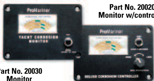
Part No. 20030 Monitor