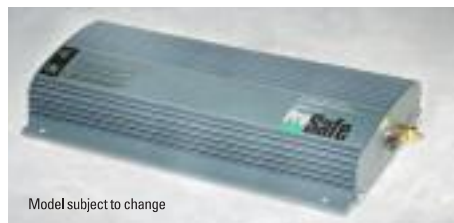
ProSafe 100 Amp Galvanic Isolator For dual 50 amp or single 100 Amp shore cord