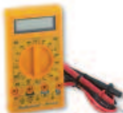
Part No. 60016