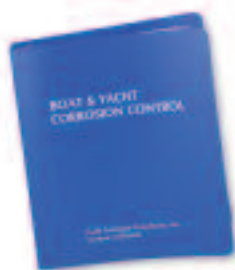
Part No. 20001